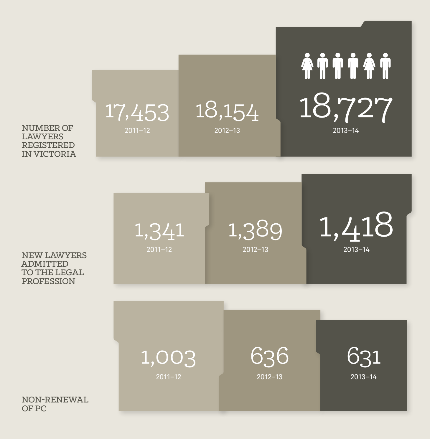
Figure 2: Numbers of lawyers registered in Victoria

There were 18,727 lawyers registered in Victoria at 30 June 2014. The number of lawyers registered in the state grew by 573, a 3% increase over the previous year. 1,418 new lawyers were admitted to the legal profession between 1 July 2013 and 30 June 2014, 2% more new admittees than recorded last year. The number of lawyers who did not renew their PCs for the year end 30 June 2014 was 631 lawyers. Figure 2 illustrates this change.